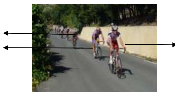
3 racing cyclists: a green, a blue and a white one