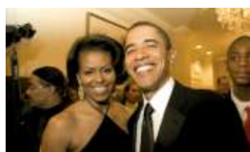
Barack and Michelle Obama