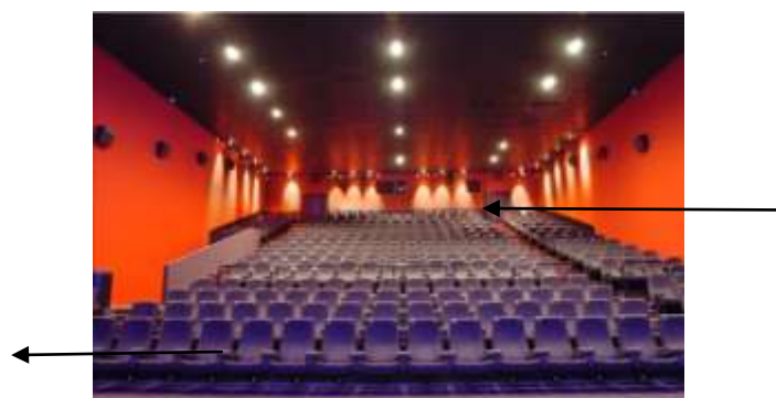
a cinema theater

BETWEEN.....AND/ OPPOSITE/ AT THE FRONT/ AT THE BACK/ BEHIND/ IN FRONT OF/ ON THE LEFT/ON THE RIGHT